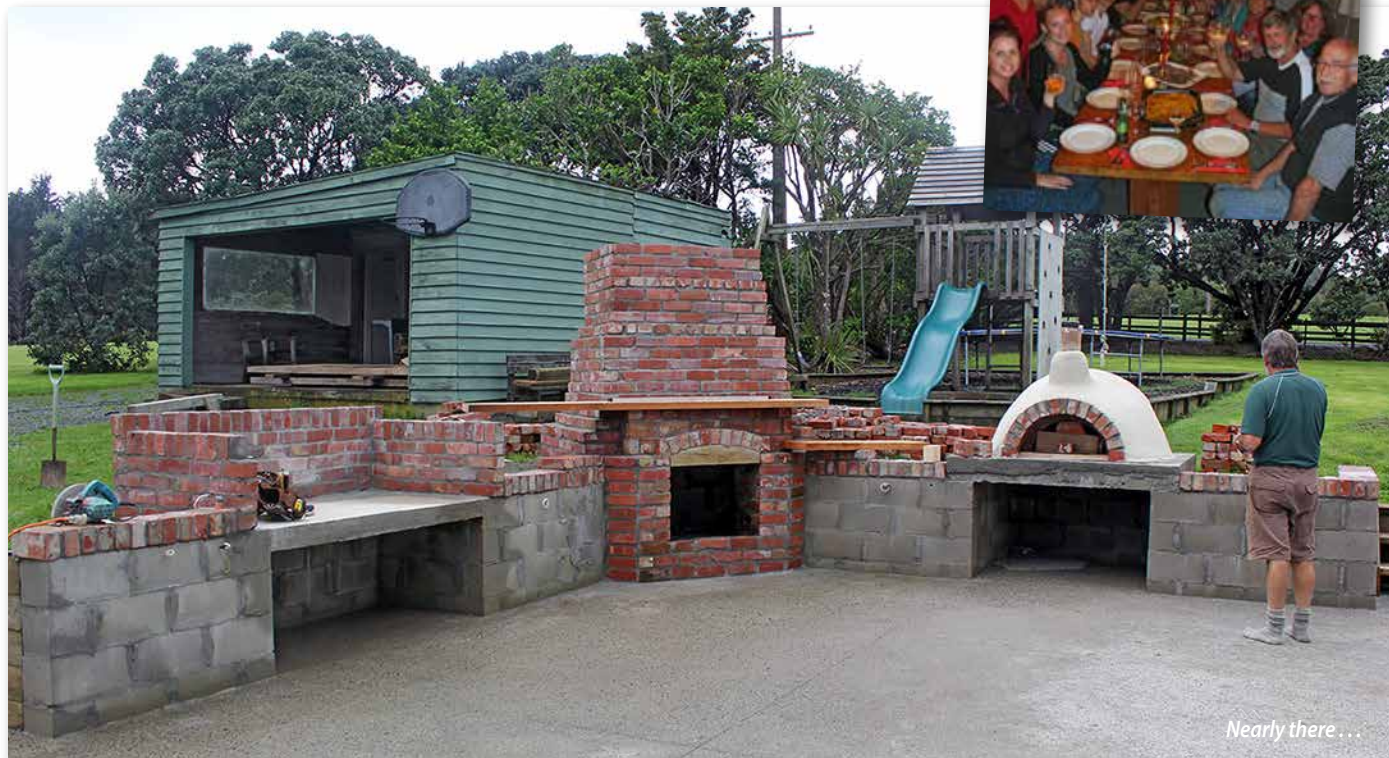
Nearly there ...