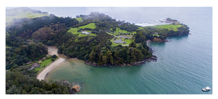
Ballot draw will be at the Open House in March